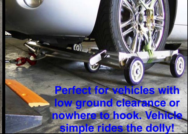
Carrier Dolly Patent No. 8910957

Perfect for vehicles with low ground clearance or nowhere to hook. Vehicle simple rides the dolly!