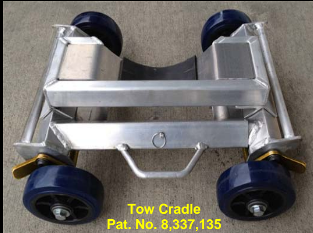
Tow Cradle Pat. No. 8,337,135